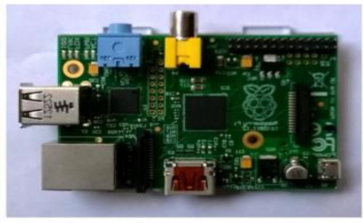
Fig 1. Raspberry Pi board.